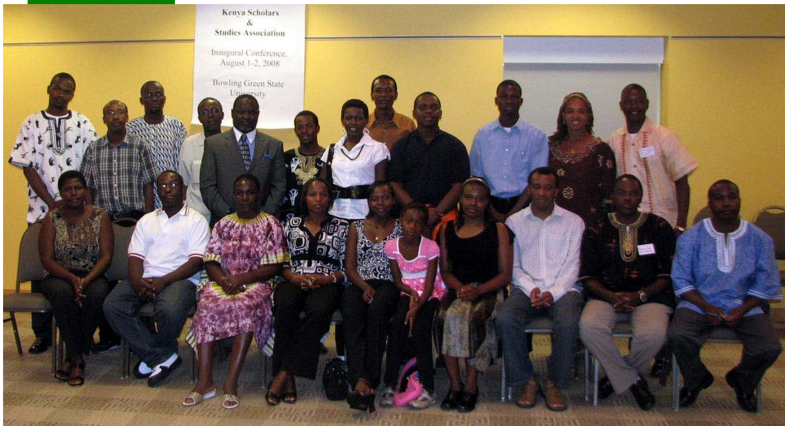
A portion of the participants at the Inaugural KESSA conference at Bowling Green State University, August 1-2, 2008

A Newsletter of the Kenya Scholars and Studies Association